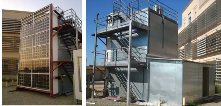
Figure 1. LOT test facility. Front and rear view.

The LOT test facility (see Figure 1) is composed by a variable width double-skin BIPV façade and an adjacent test room. The external dimensions of the test facility are (3.5 x 5.5 x 3.6) m.