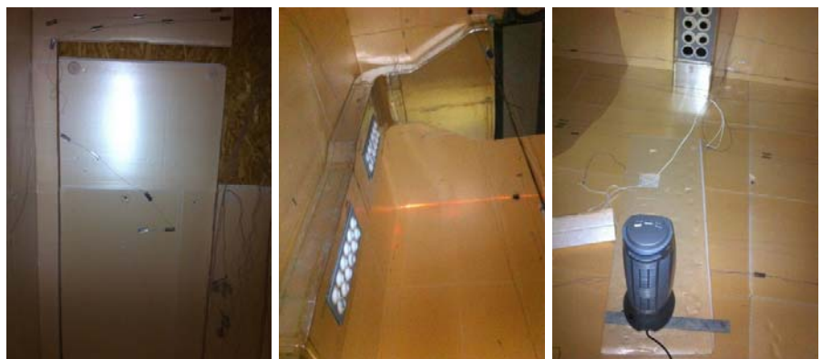
Figure 6. View of the heat flux tiles

To evaluate the energy balance of the test room, homemade flux tiles are installed. EPS panels are placed at the internal side of the walls, the floor and the roof with the aim of covering the overall internal surface of the test room. Only the south façade, where the test element is placed, is kept without these tiles. Two type T thermocouples are placed at the same height in both sides of the EPS panels. The thermocouples are protected from the solar radiation with a reflective adhesive tape. An overall number of 72 pairs of thermocouples are installed spread over the walls, floor and roof of the test room. Since the thermal conductivity of the EPS panels has been previously measured in laboratory, the heat flux which crosses each panel is obtained from the temperature difference measurements multiplied by the conductivity (following Fourier's law). The effect of the thermal inertia of the EPS is calculated each times step when non-stationary tests are performed.