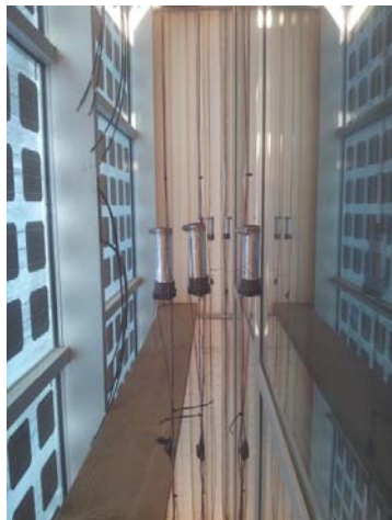
Figure 8. Thermocouples placed at air gap

The surface temperature of the double-skin component is also measured at 3 different heights 2 positions. The ventilated air gap is also measured at 3 different heights (1m, 3m, 5m) and two horizontal positions (see Figure 7).