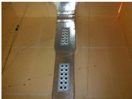
Figure 4. HVAC system. Air distribution system

The HVAC system is composed by a reversible electric heat pump. A special air distribution system has been designed to avoid temperature stratifications within the control volume (see Figure 4). This HVAC systems allows for a detailed control of the set-point temperature within the test room. The energy consumption and the thermal energy delivered to the test room is measured each time step with the data logger.