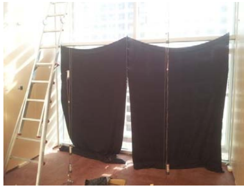
Figure 5. Mounting the inner solar protection

A black curtain (see Figure 5) is placed inside the test room at 40 cm distance from the south façade to be tested: the transmitted solar radiation heats up the high absorptive curtain which transfers this energy to the test room by means of convection and long wave thermal radiation. This approach avoids a disturbance of the direct solar radiation over the wall temperature measurements.