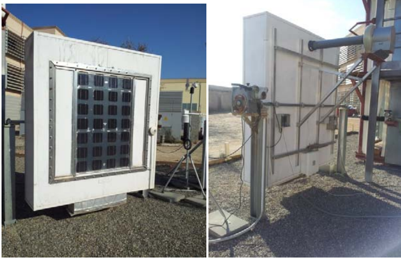
Front and rear views of the Test Reference Environment of Lleida (TRE-L) at the LOTCE center [3].

The energy characterization of ventilated BIPV components is also carried out in the Test Reference Environment of Lleida (TRE-L) [3-6].