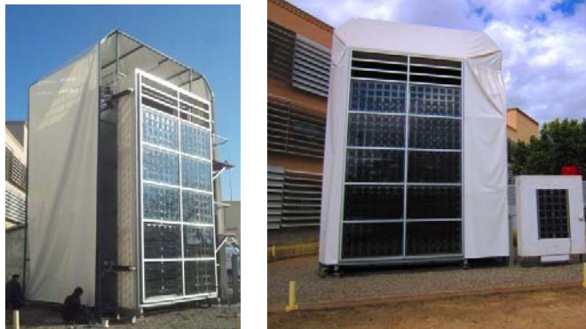
Figure 2. LOT test facility protected from solar radiation effects

To avoid uncertainties due to the effect of the solar radiation, the LOT has been covered by a white plastic sheet.