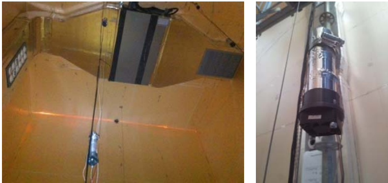
Figure 7. Position of thermocouple to measure the air

The air temperature inside the test room is measured with type T thermocouples at five different positions and considering 5 different heights (0.5m, 1.5m, 2.5m, 3.5m, 4.5m). These sensors allow for the control of the ventilation system to avoid stratification (see Figure 6). The thermocouples are shielded from the solar radiation with copper cylinders and reflective coating. Micro fans are also installed at the bottom of the cylinders to avoid overheating of the temperature sensors.