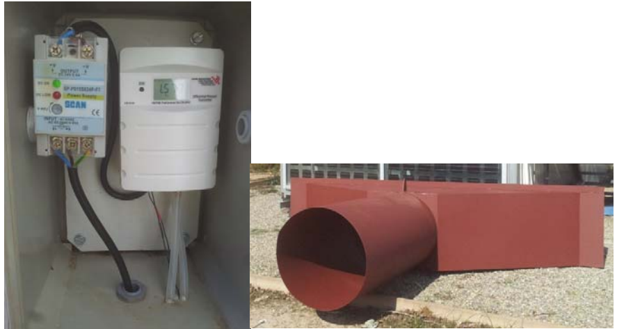
Figure 8. Differential pressure