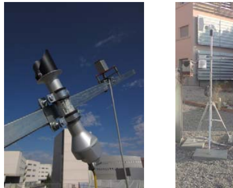
Figure 9. Weather station

The outside conditions are measured with a local weather station placed at 10 m height (temperature, relative humidity, horizontal solar radiation, wind direction and speed). This weather station also measures direct solar radiation with a pyrelimeter ( see figure 9). In addition, ambient temperature, wind direction and speed are measured next to the LOT, at 2 m height.